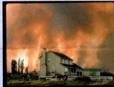
Protecting lives and communities

The partnership includes: Kaibab National Forest; Arizona State Land Department; Coconino County; City of Williams; Sherwood Forest Estates; Ponderosa, Williams, Summit and Fort Valley Fire Districts; NAU Ecological Restoration Institute; and University of Arizona.