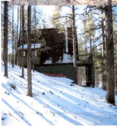
Assistance for protecting your property from wildfire